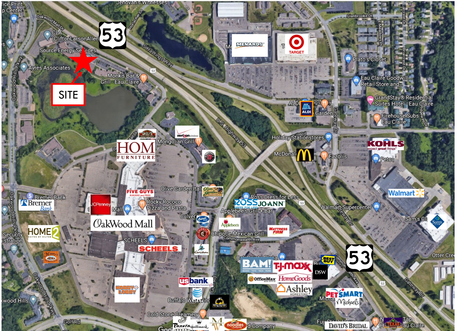
Google Maps, 2020