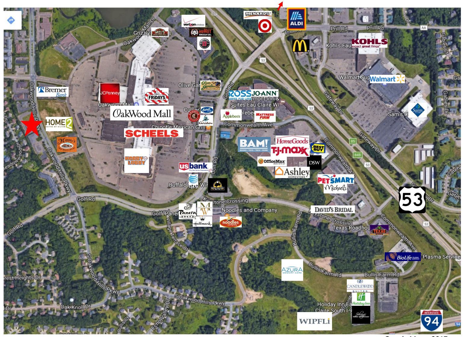
Google Maps, 2017