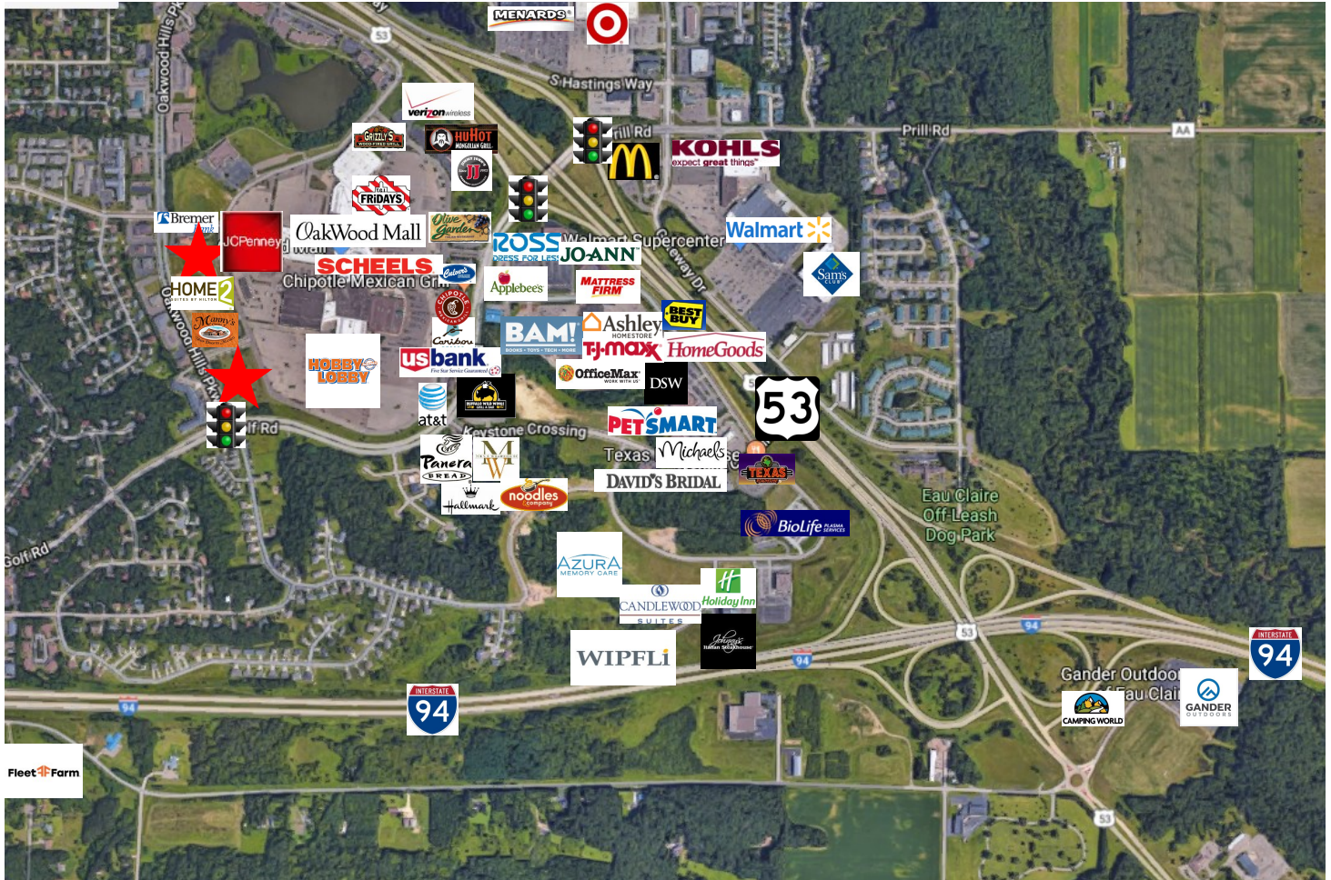
Google Maps, 2018